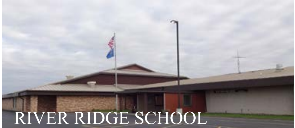
RIVER RIDGE SCHOOL