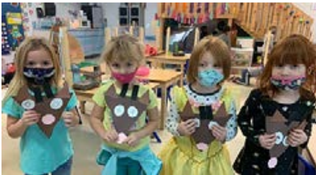
Rudolph, Rudolph, can you give a wink? Santa won't recognize you if your nose is pink!