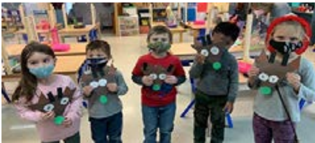
Rudolph, Rudolph, can you set the scene? Santa won't recognize you if your nose is green!