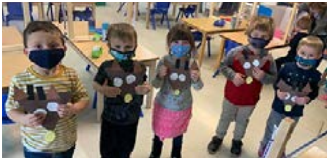
Rudolph, Rudolph, what a funny fellow! Santa will be lost if your nose is yellow.