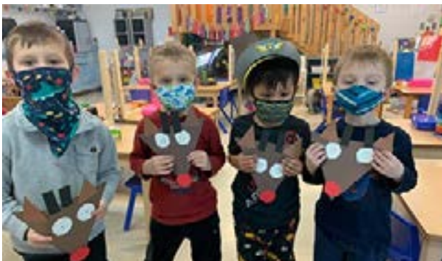
Rudolph, Rudolph, time to find the sled. Santa knows you're ready since your nose is red!