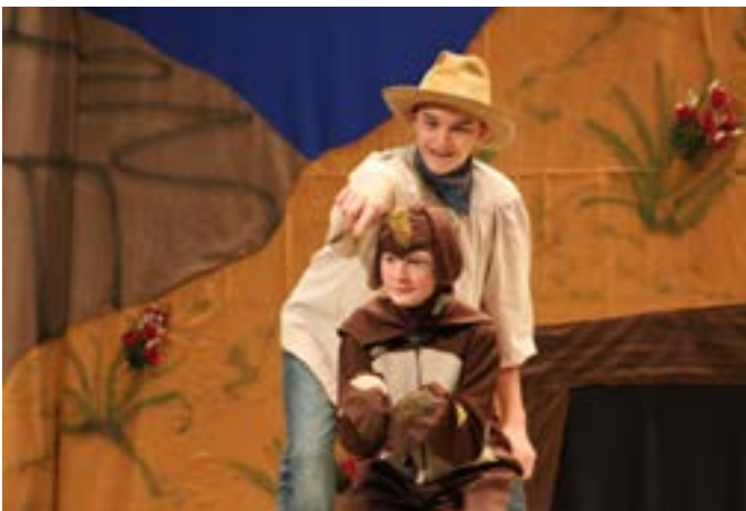
Beast and Clyde