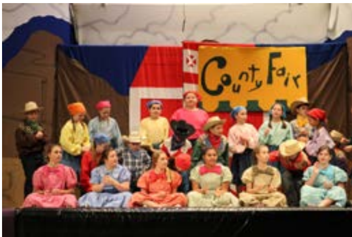
Younger Daughters and Country Folks