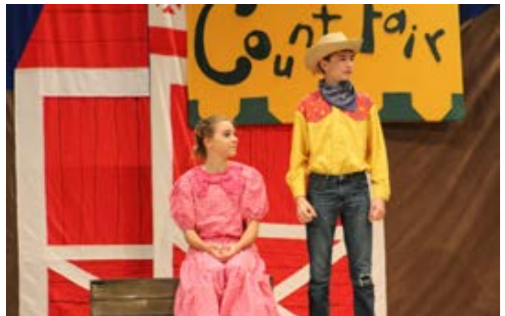
Younger Beauty Lou and Imaginary Friend