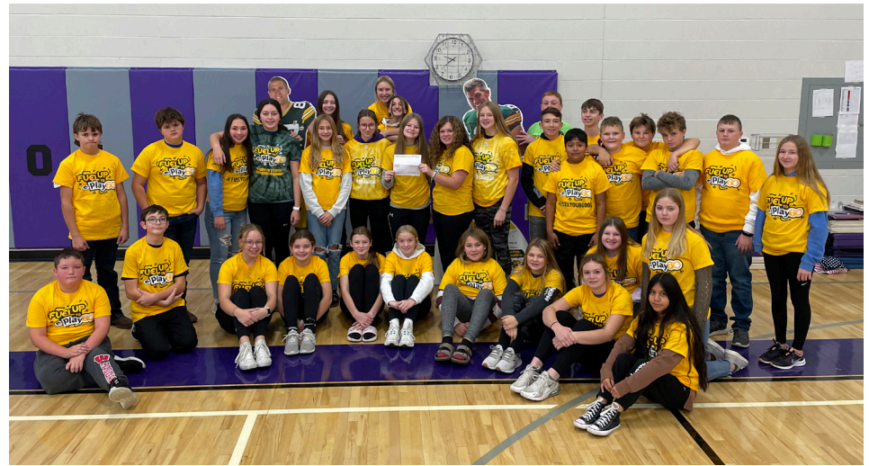
The Wisconsin Milk Marketing Board donated $350 to the River Ridge Middle School Fuel Up to Play 60 Team. The money donated will help the team host events in the Middle School to promote youth wellness and build a healthy community. Pictured above are the River Ridge Fuel Up to Play 60 members.