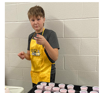
The Fuel Up to Play 60 team served up 350 smoothies in a two day event. Thank you to the Wisconsin Milk Marketing Board and dairy farmers for helping make this event happen for the students.