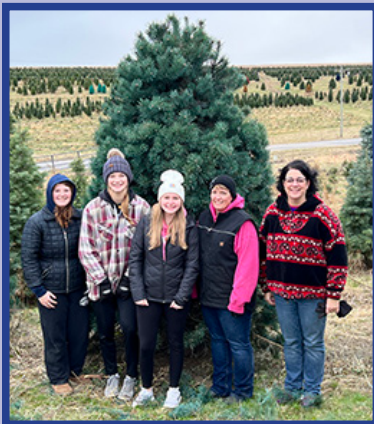
Student council members purchased a tree to place in the entrance of the high school building for all to enjoy during the holiday season. Happy Holidays!