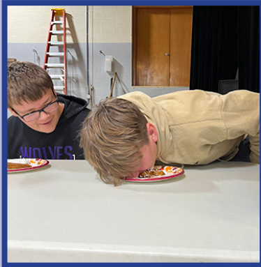
The High School Student Council hosted a pie eating contest prior to Thanksgiving break.