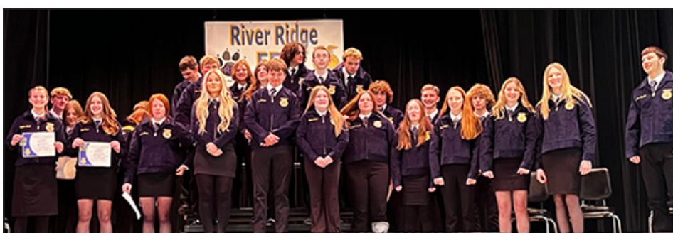
Chapter Degree Recipients