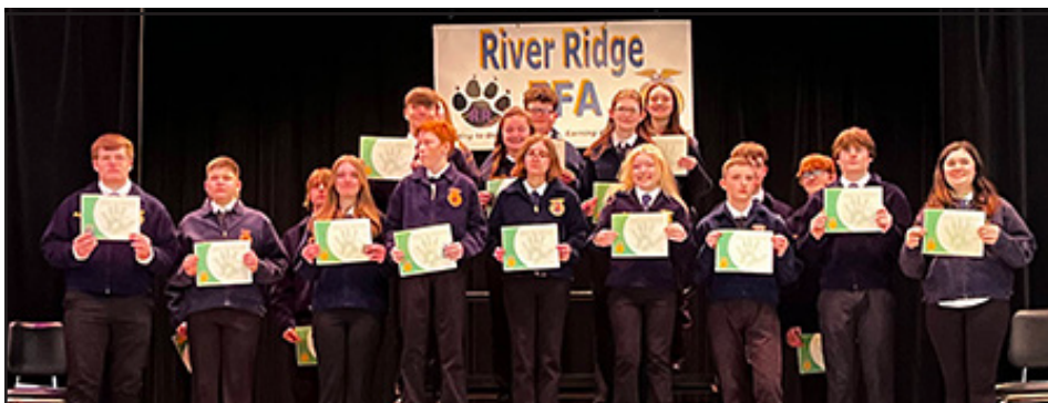
Greenhand Degree Winners