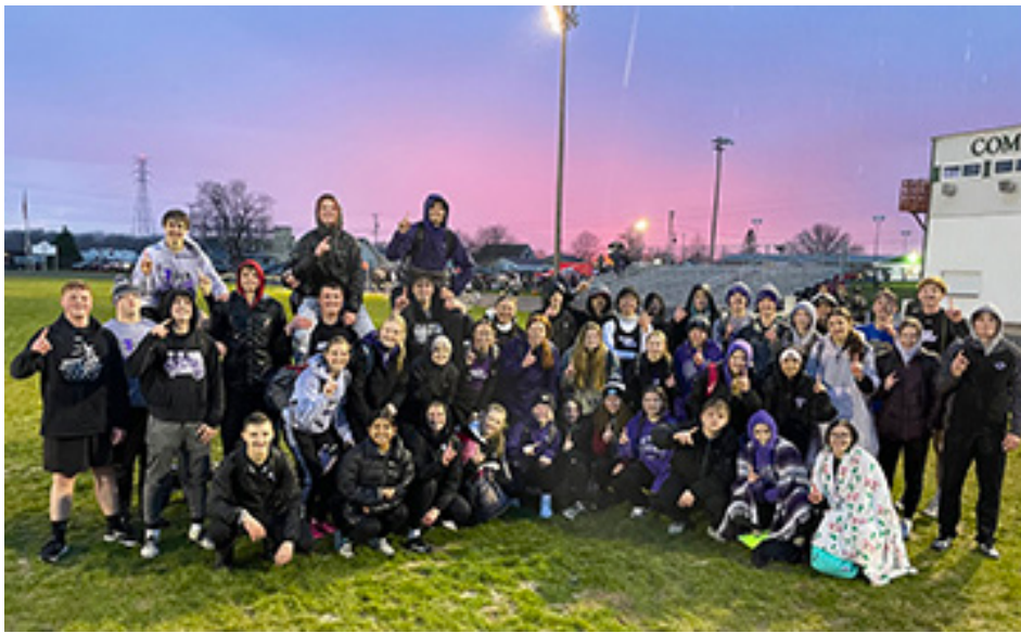
The River Ridge Boys and Girls Track and Field Teams brought home the Championship of the Cassville - Potosi Invitational on April 11.