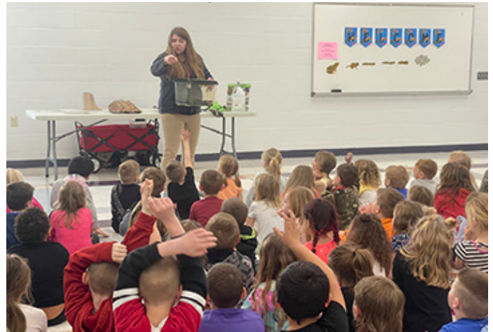
We had a FUN ending to National School Library Week!