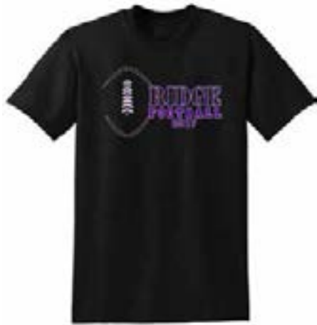
50/50 T-Shirt $10.00