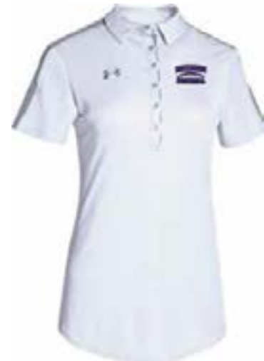
Ladies Colorblock Polo $48.00