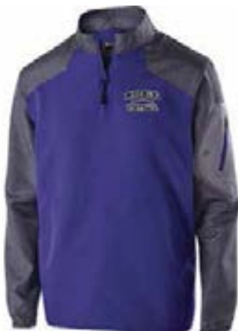
Raider Pullover $49.00