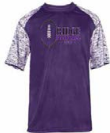
Sport Blend Tee $20.00